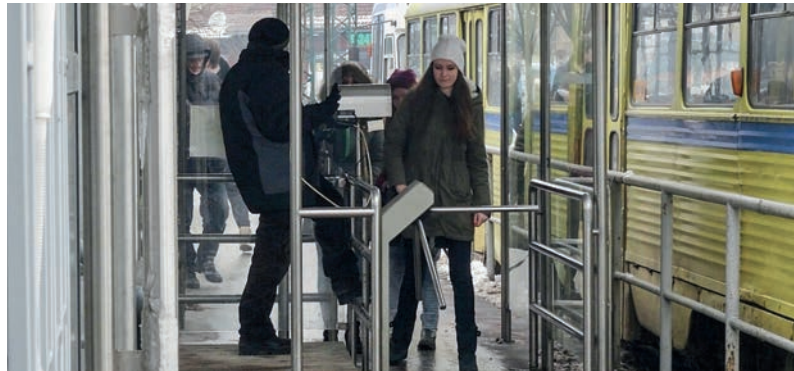
Tram station, Sarajevo