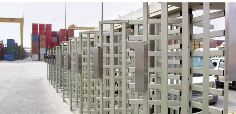
Jebel Ali Port, UAE