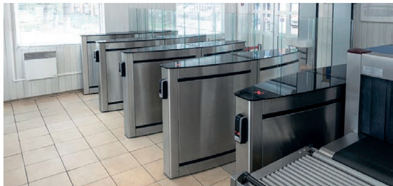
Vnukovo International Airport, Russia