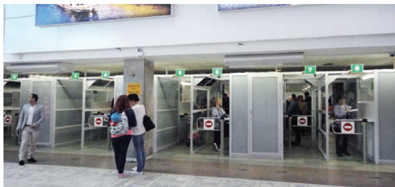
Pulkovo-2 International Airport, Russia