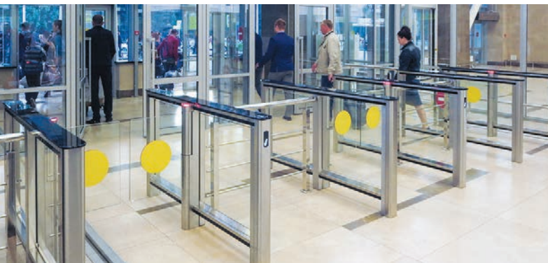
Krasnoyarsk International Airport, Russia