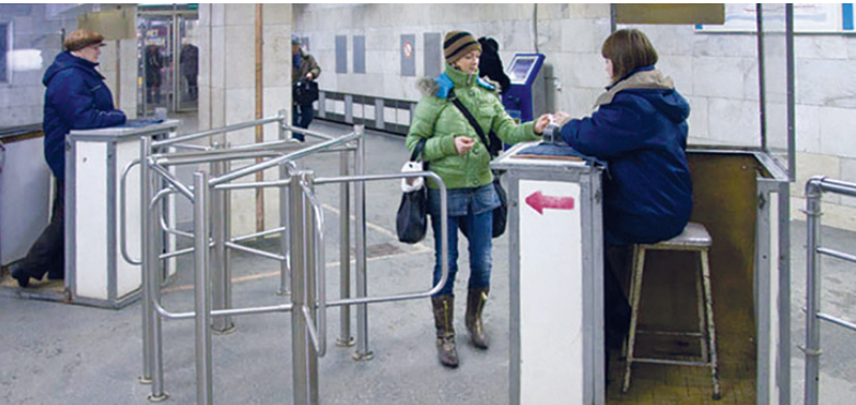
Metrotram Underground tramway line, Russia